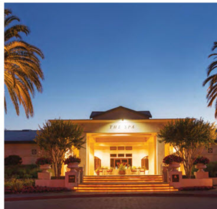
The Spa Exterior.