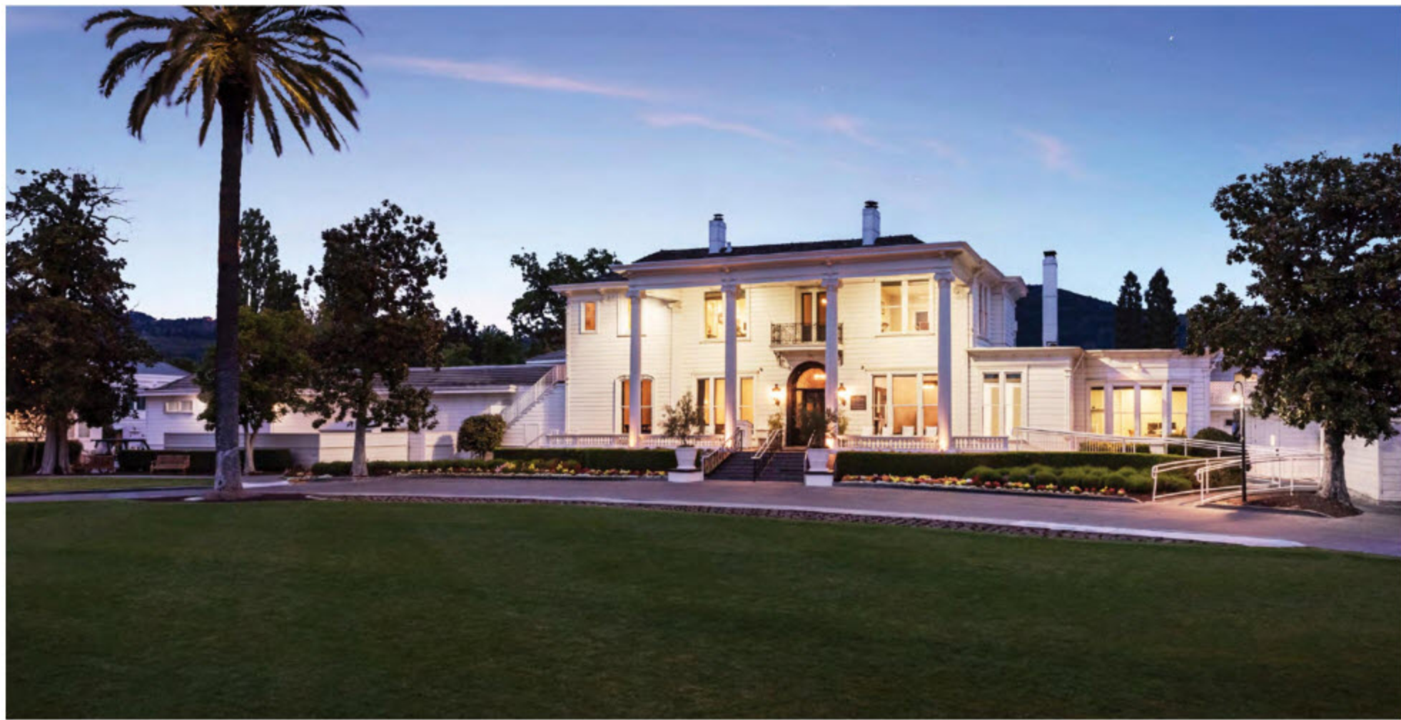
Silverado Resort and Spa Exterior at night.