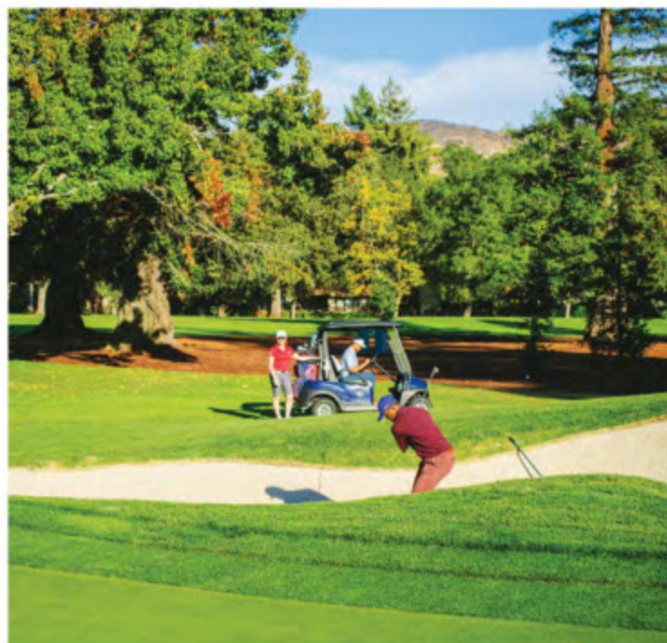
North Course #17.